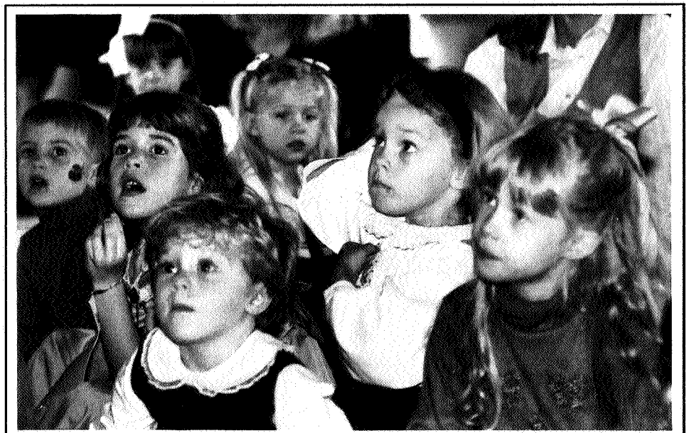
What a story! Bring your children and come join the fun on December 6!