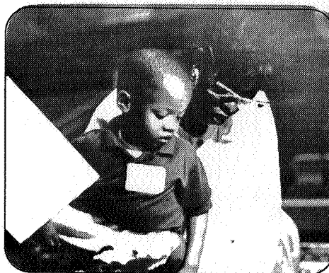
There is no age limit for enjoying books! One of the children from Frederick Douglass Elementary School gets a lift from teacher.