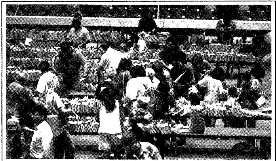
Books! Books! Everywhere! Bring the entire family and browse the booksale tables.

Passes for the Preview Sale will be in the mail soon. Family passes will have a $5 discount coupon included. Parking is available at the Tranquility Parking Lot, along the streets and in the Coliseum parking area (Coliseum parking is available Saturday and Sunday, only).