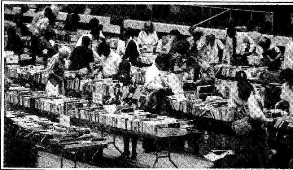
The booksale features thousands of books for readers of all ages.

The Friends of the Houston Public Library hope to attract record numbers of area bookworms to the 14th Annual Bargain Booksale, April 10 - 12, with all proceeds pledged to benefit the library. The Sam Houston Coliseum, corner of Bagby and Walker, will be transformed into a vast bazaar with more than 70,000 books of all kinds for sale, most for $1 or less.