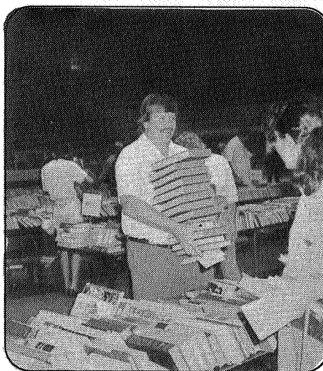
A bargain hunter found some treasures...

For more information, call the Friends office at 224-2492.