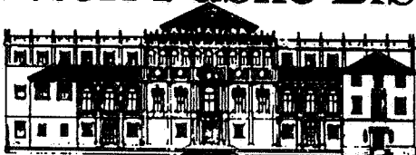
Julia Ideson Building

Friends of the Houston Public Library 500 McKinney Houston, Texas 77002