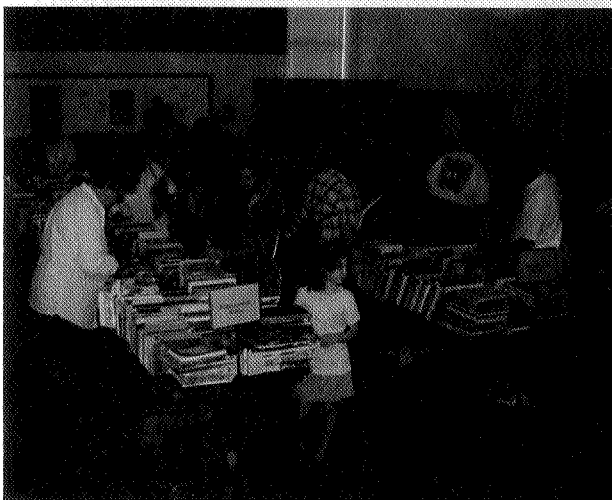
HISD's Doris Miller Center Auditorium was especially crowded with book buyers on Thursday morning.